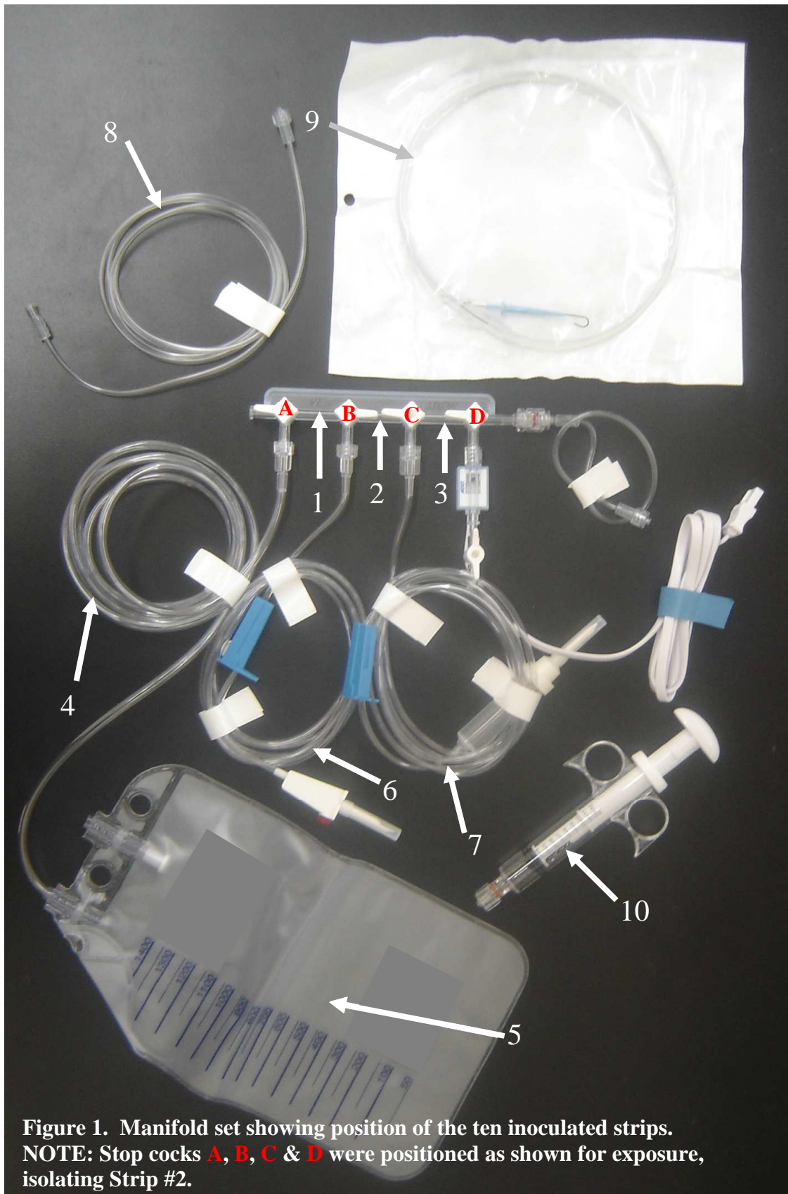
Figure 1. Manifold set showing position of the ten inoculated strips. NOTE: Stop cocks A, B, C & D were positioned as shown for exposure, isolating Strip #2.